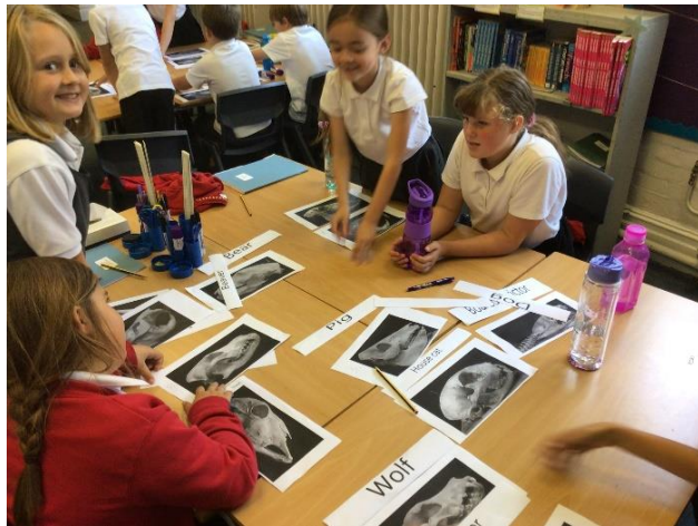
Collaborative learning in science

“Develops high expectations in every child so that they are ambitious and believe in themselves.”