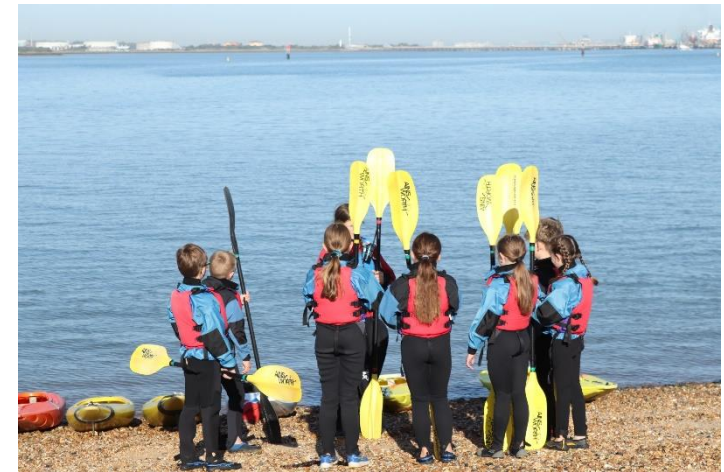
Year 5 and 6 residential

“Expect children to engage, explore and be challenged in their school experiences.”