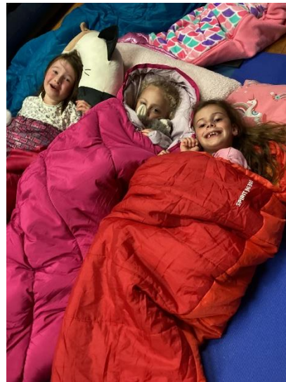
Year 3 sleepover